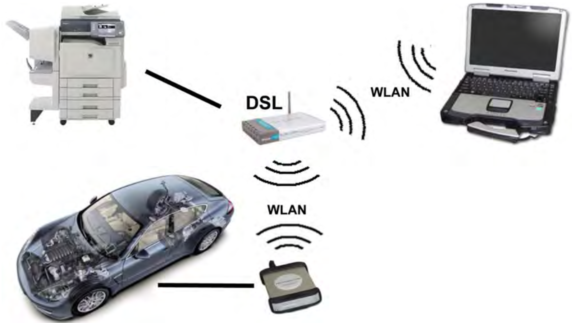
Figure 1 - Network

The new tester generation supports wireless operation over WLAN. To use this, you must have a WLAN Access Point that supports WPA2 encryption. This type of encryption will be used exclusively for safety reasons. If this prerequisite is met, the interface to the vehicle (VCI - Vehicle Communication Interface) can also be used as a wireless interface on the vehicle. The following illustration (figure 1) shows one possible network option. To use this, you must have a WLAN Access Point that supports WPA2-PSK encryption.